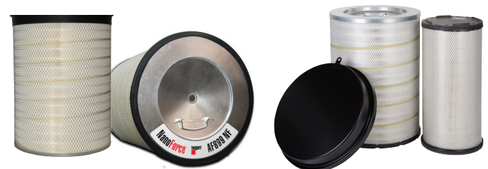
Typical 'Axial Seal' Design

** Filter kit number AA2990NF contains the AF27993NF primary and AF27994 secondary filters.